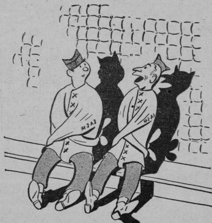
"I like the Army—what's your trouble?"