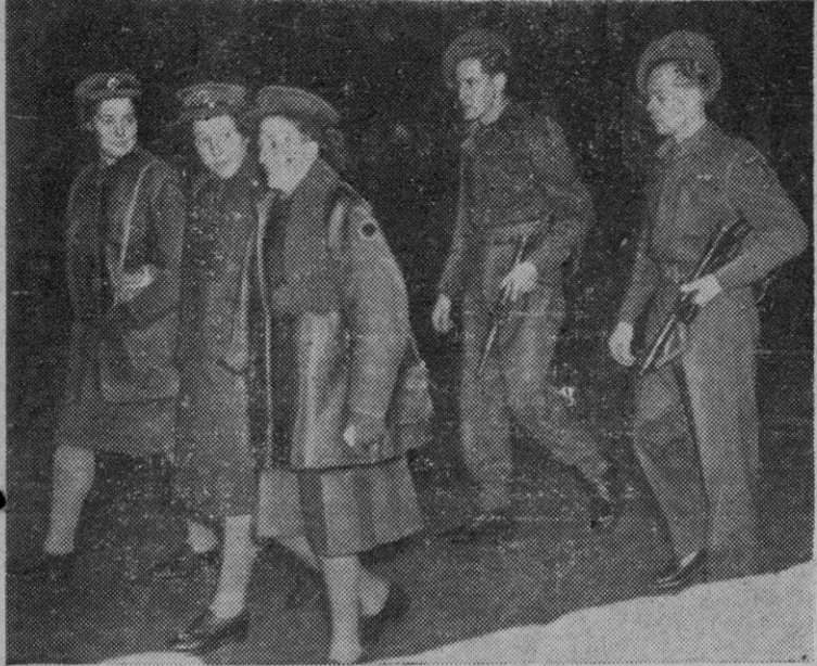
Because of recent incidents in Berlin, the British are providing armed escorts for their service girls who go out after dark. Three ATS girls are shown being convoyed by two Tommies armed with sub-machine-guns.