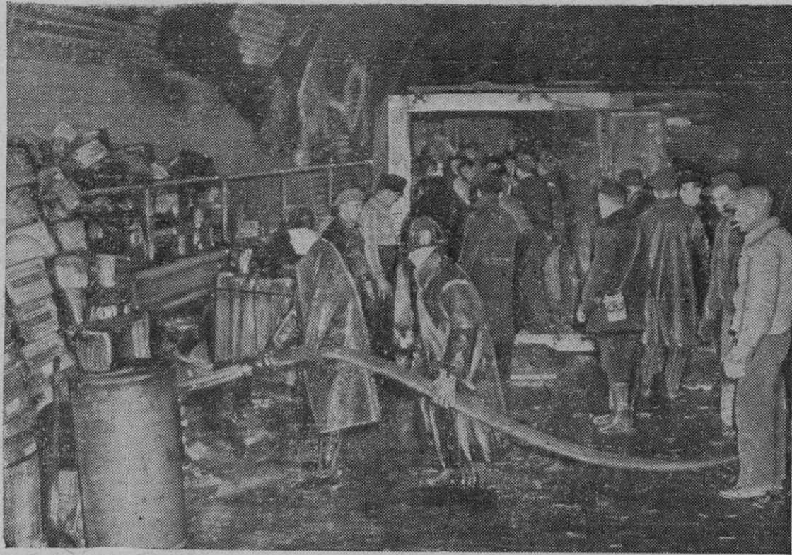
Firemen pour water on a truck which caught fire in the Holland Tunnel, tying up traffic for three hours. The truck carried a load of chewing gum and the job of clearing away the melted gum remained after the blaze was under control.