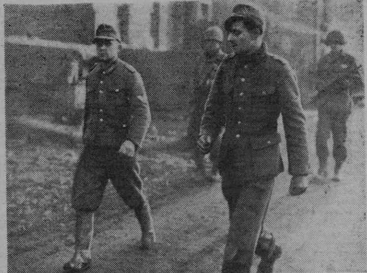
The first Germans captured by the Ninth are marched toward the rear lines less than four hours after the jump-off.