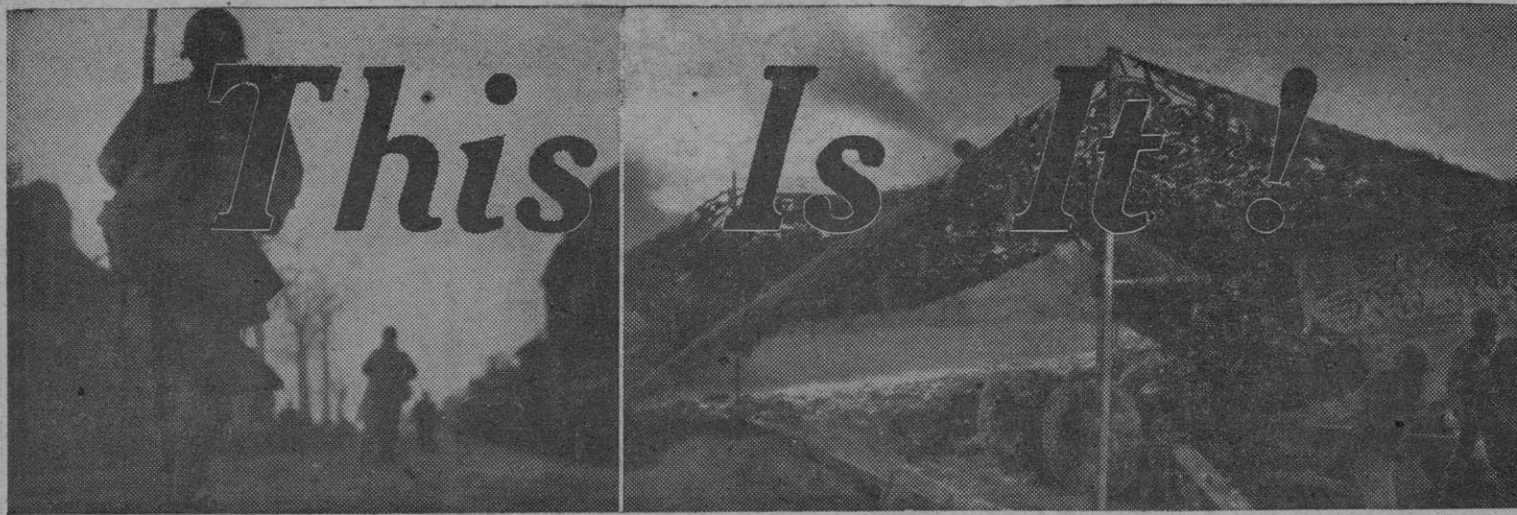
Stars and Stripes