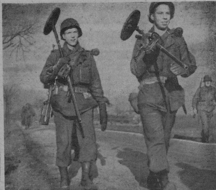
Mine-detecting engineers march toward the Roer where they got plenty of business locating enemy mines on the west bank.