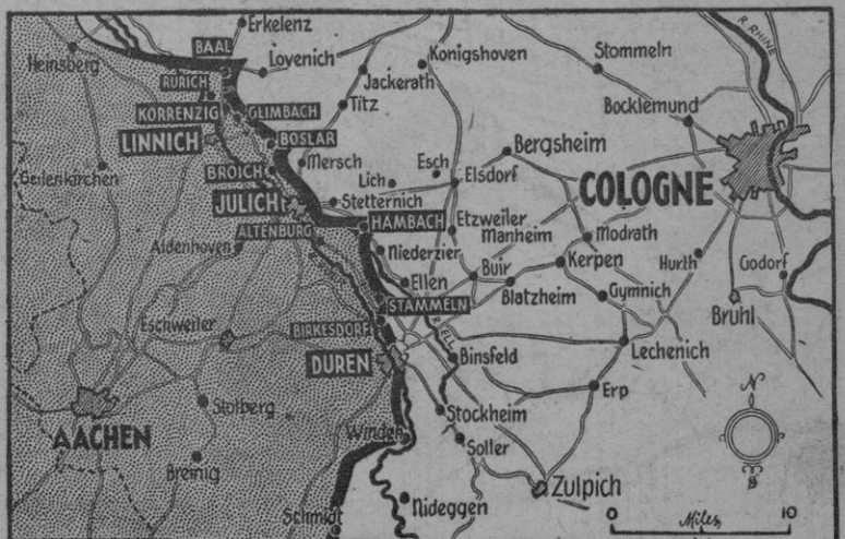
Nineteen towns have fallen to the First and Ninth Armies since they began their assault, and late yesterday half of Duren had been cleared.

"The thinkers" in Washington expressed the general belief that the American drive is certain to carry the First and Ninth to the Rhine in rapid fashion; but they (Continued on Page 8)