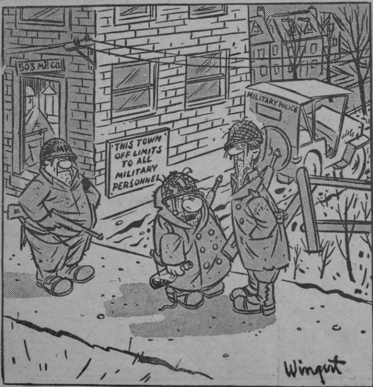
Okay! so the old buzzard don't want a drink. Let's go take a town of our own!