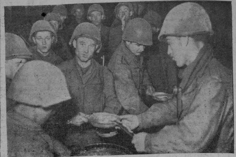
Less than an hour before zero hour these doughs of the Ninth Army had hot chow. They hit the east bank of the river carrying two K-rations in their kits.