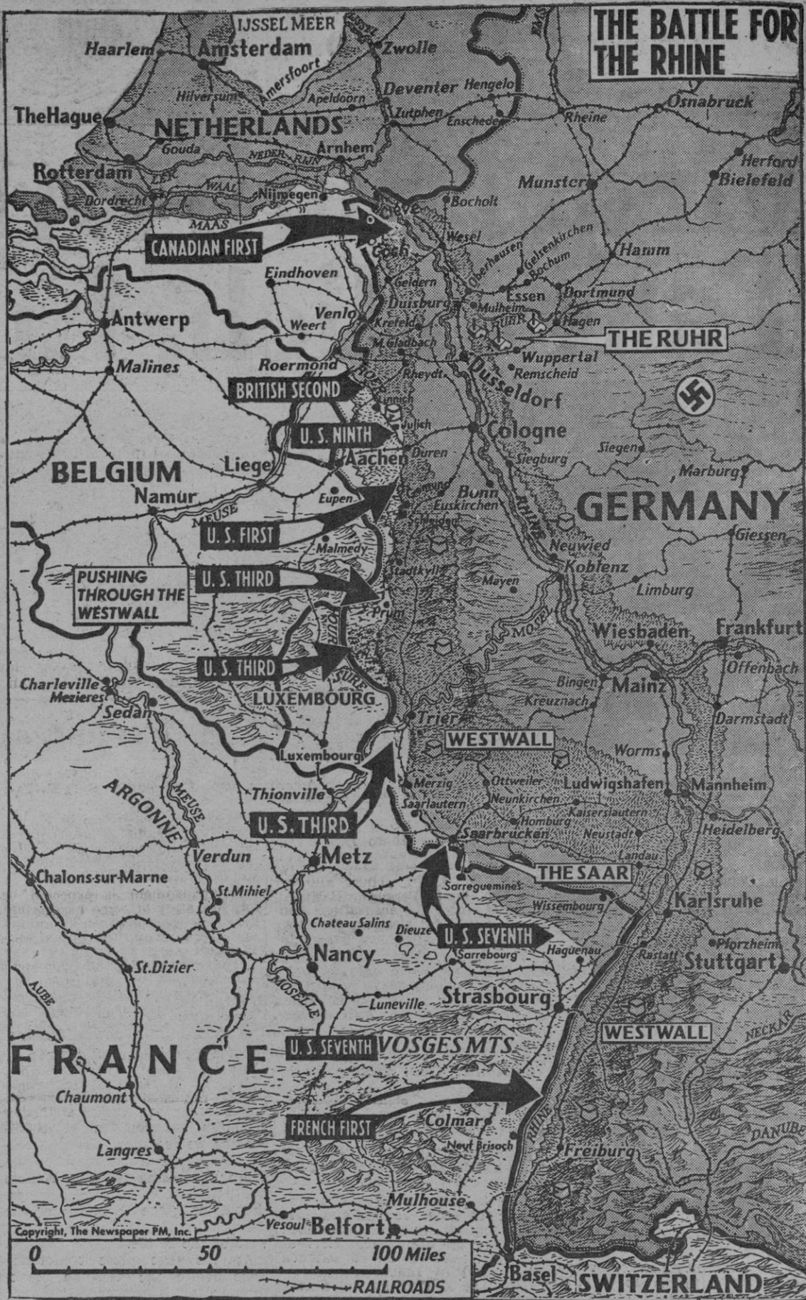
The U.S. First and Ninth Armies have smashed forward across the Roer in what Gen. Eisenhower has described as the blow intended to destroy the German Army West of the Rhine. In addition to the First and Ninth, however, the American Third and Seventh are moving ahead at good speed, and the Canadians are expected to resume their offensive beyond Goch.